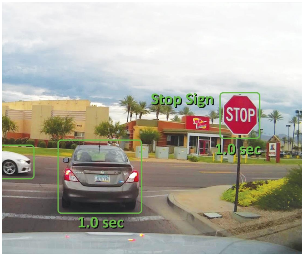
Typical Outward Facing Camera View A stop sign has been detected. The following distance (in seconds of travel at present speed) is also shown.